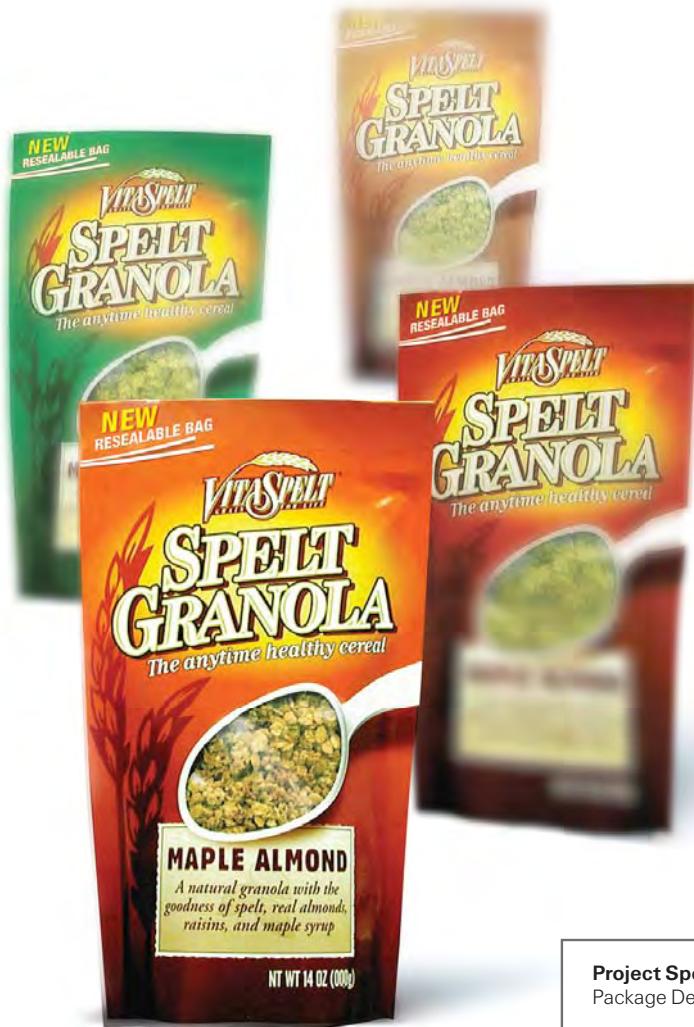
Project Specifications Package Design